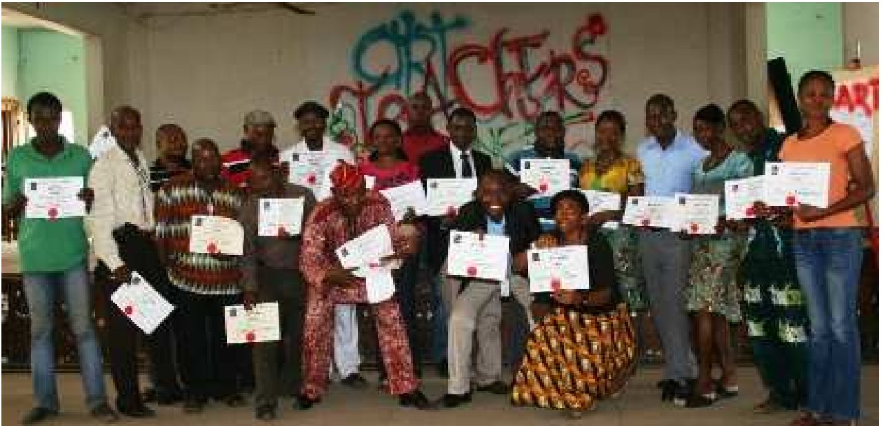
Group photograph of the art teachers displaying their certificate of participation.